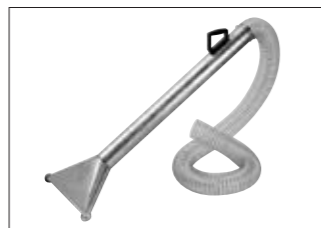
Fig. Floor cleaning set