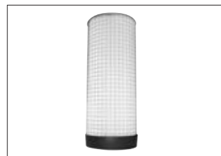
Fig. Filter cartridge