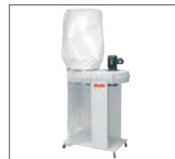
Fig. see MOBIL 125 – 200