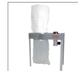
Fig. AAS 1013

The particularly robust design comprising durable, high-quality components is produced from a full metal housing made of galvanised steel plate. Largely pre-assembled elements with supplied filter bag, swarf bag, support feet and installed switch guarantee short installation times.