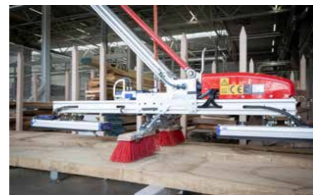
> Automatic wipe-off function