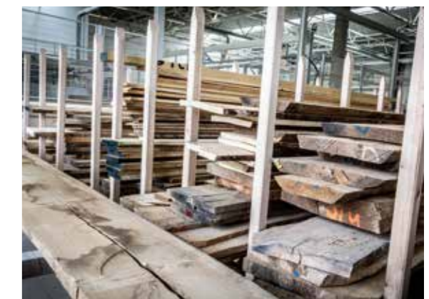
> Fully automatic loading and unloading of solid wood