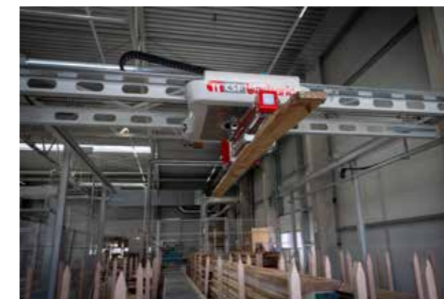
< Special suction traverse

A laser scan of the surface not only allows the edge contour to be recognized, but also gives the operator a very good image of the wood grain and surface for the retrieval and feeding process. This makes it possible to determine whether the wood pattern is suitable for further processing or if it is necessary to select a different workpiece to be retrieved.