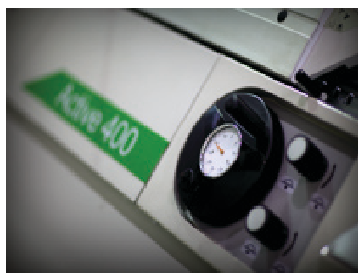
Tilting Movement of Main Saw Blade with Hand Wheel Indicator