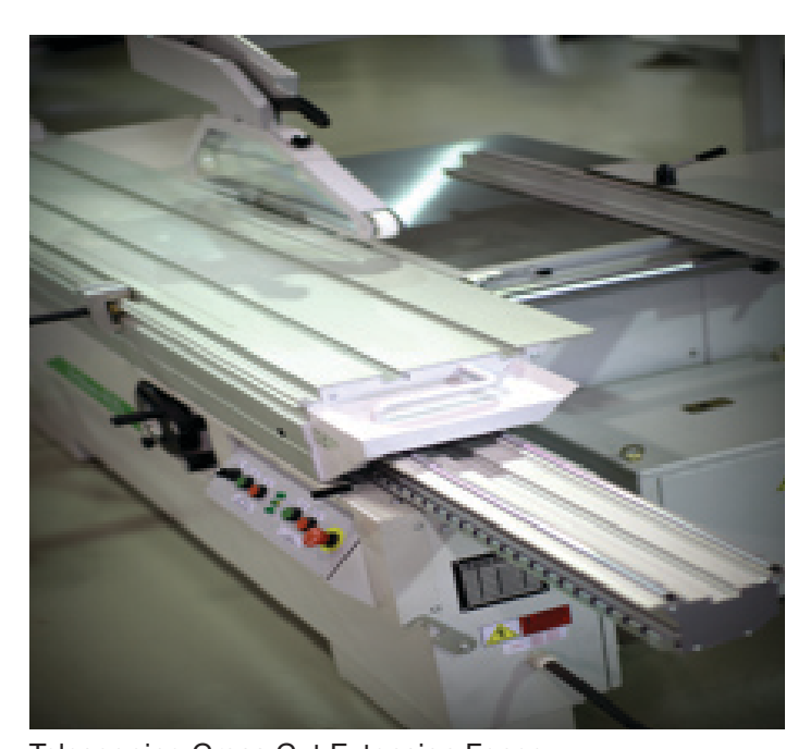
Telescoping Cross Cut Extension Fence