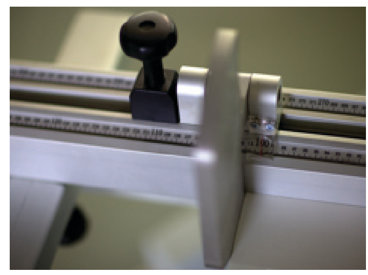
Precision Flip Stops with "Easy Read" lens