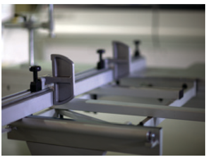
Telescoping Cross Cut Extension Fence