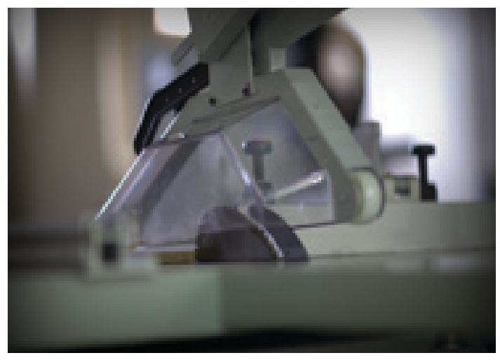
Blade Cover with Safety Guard and Dust Extraction Port.