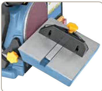
Tiltable sanding disc table (0° to 45°) features mitre fence.