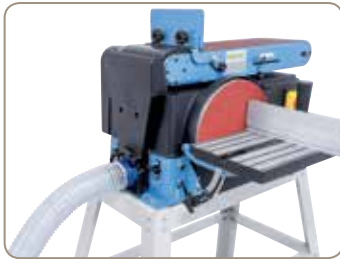
Comes complete with integrated dust port to connect a dust collector