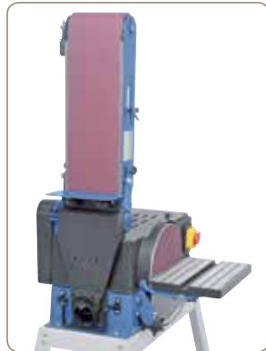
Surface grinding table can be used in horizontal or vertical position.