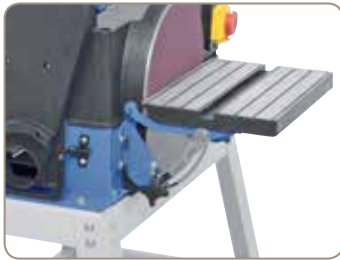
Aluminium support table can be tilted steplessly from 0° – 45°.