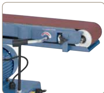
Quick clamping device allows for a belt change without tools.