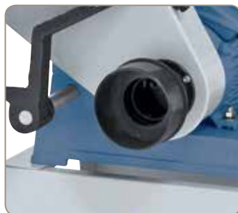
Dust port comes with a choice of a 60 mm or 100 mm connection.