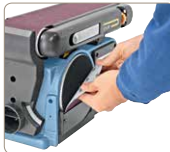
Includes velcro fastener to fasten the sanding disc.