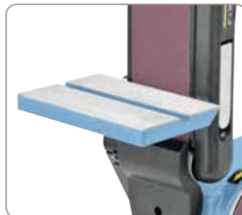
Sanding disc table can also be used for belt sanding.