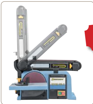
Belt sanding table tilts steplessly from 0° to 90°.