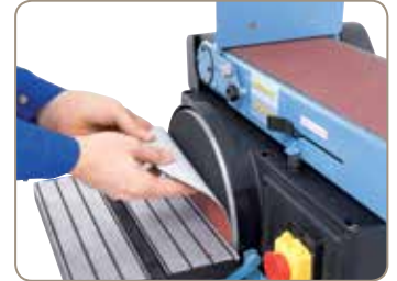
Hook and loop fastener allows for quick and easy change of sanding disc.