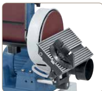
Sanding table tilts from 0° to 45°.