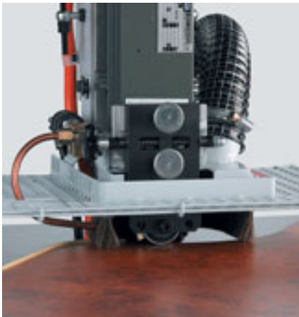
Contour-trimming Constant trimming results through the use of precise ball bearings to trace the workpieces..