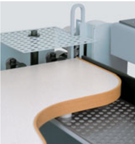
End trimming unit EK 13 for FTK 130 Optimat and KTD 720 Optimat (optional) For the exact end trimming of overhanging edge materials on shaped and straight workpieces.

Modern 12.000 rpm trimming motors, based on frequency-inverter-technology for maximum output. The standard machine is fully equipped to cover the entire range of trimming work on different workpieces. A centric copywheel and a fine adjustable top and bottom tracing device ensure optimum accuracy and perfect trimming results.