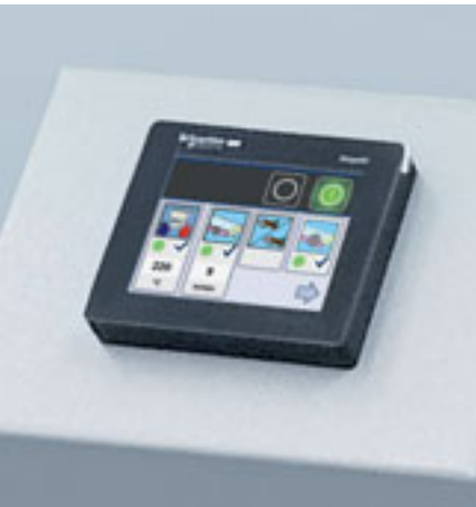
Intuitive operation via 3,5" touch display.