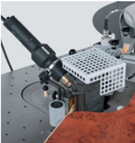
Additional heating unit (optional) To pre-heat thick PVC-edges.