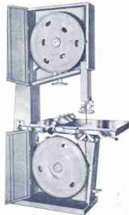
Mod. "COMPACT C" Pressed steel frame - disc wheels - shoe brake - star delta-starter.