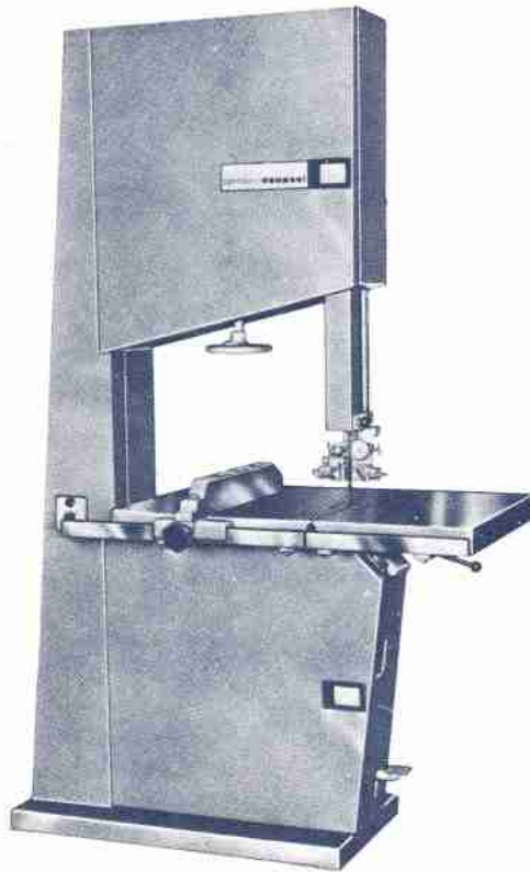
Art. 2226 Band saw - Mod. "COMPACT" da 450 - 600 - 700 - 800