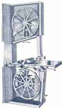
Mod. "COMPACT S" Pressed steel frame - spoke wheels shoe brake - direct switch.