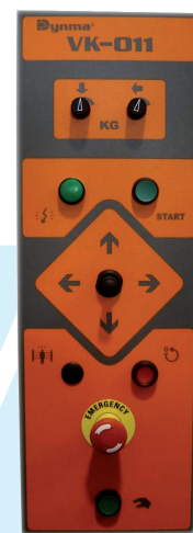
Simplified control panel for "ECO" version.

Copyright 2011. Desarrollo Industrial de Maquinaria Benicarló S.L. The information contained in this document is subjected to change and it is not binding.