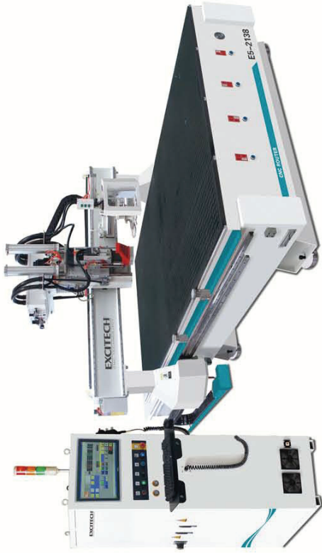
Drill Bank, Pop-up Position Pins Optional