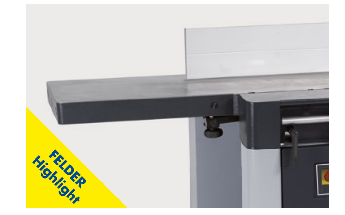
Planer table 2,200 mm Long, solid ribbed cast iron planing table ensures long lasting reliability even when under maximum load.

The planer fence: A masterpiece of space saving design that ensures stability and precision! The planer fence can be tilted to any position from 90° to 45°. There is an end stop at both the 90° and 45° positions.