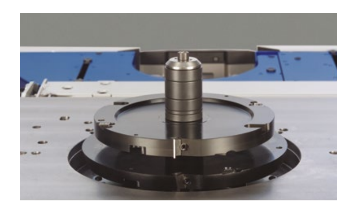
Table opening: 320 mm

The large spindle table opening offers you maximum working safety: Large dimensioned panel raising tools as well as slot and tenoning tooling can be used below the table surface.