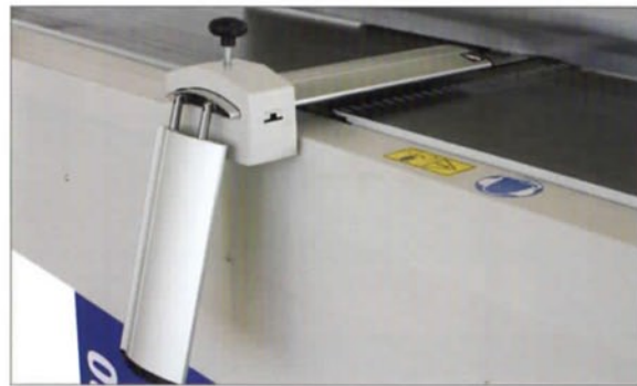
Ⓞ: FOLDABLE CUTTER HEAD GUARD