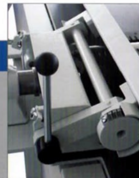
Ⓢ: ADJUSTMENT OF TILTABLE FENCE