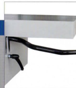
Ⓢ: ADJUSTMENT OF WORKPIECE REMOVAL