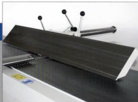
Ⓢ: TILTABLE FENCE 0° - 45°