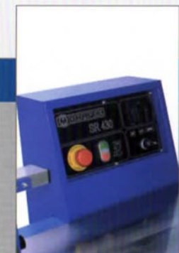
Ⓞ: UPPER CONTROL PANEL