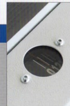
Ⓢ: DEPTH OF CUT INDICATOR