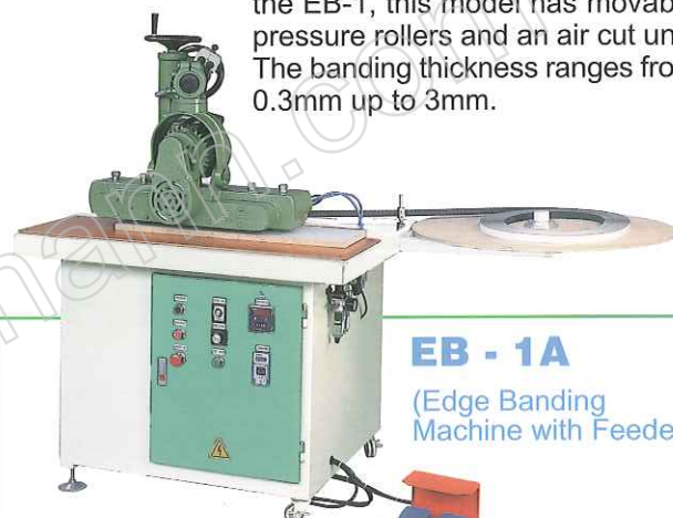
EB - 1A (Edge Banding Machine with Feeder)

Besides having all the features of the EB-1, this model has movable pressure rollers and an air cut unit. The banding thickness ranges from 0.3mm up to 3mm.