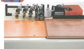
EB - 1S

Working thickness of up to 120mm when using the edge banding material "Melamine Veneer".