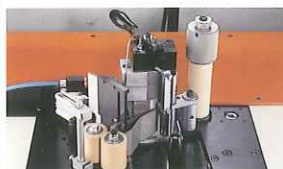
EB - 1H

Working thickness of up to 120mm when using the edge banding material "Melamine Veneer".