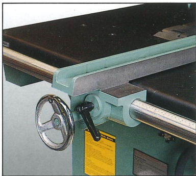
The feeding guide fence with adjustable hand-wheel and fixed very quickly.