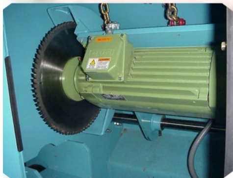
45 Automatic Cuts Per Minute

Cut Your Scrap Handling Problems Down to Size! (Specifications On Back)