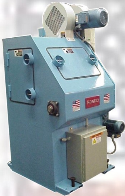
Built-In Controls and Access Panels