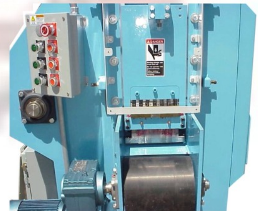
Clamping Mechanism (Guards Removed)

Cut Your Scrap Handling Problems Down to Size! (Specifications On Back)