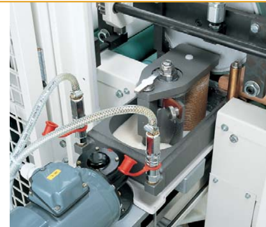
Efficient glue-cooling prolongs the pot-life of the glue considerably.