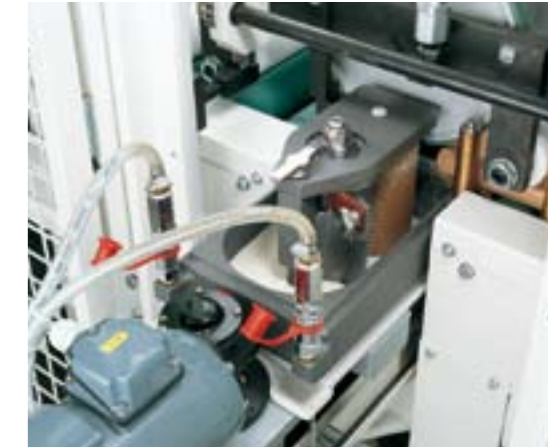
Efficient glue-cooling prolongs the pot-life of the glue considerably.

With the standard execution of the KLM parameters are set manually and the veneer is automatically transported to the alignment and glueing section accordingly.