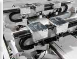
Automatically adjustable cross bar table