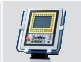
BWO CNC 920 / BWO CNC 930

State-of-the-art control system technology by Siemens or BWO. Machines connection possible via post-processors to CAD.