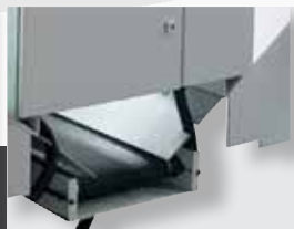
Chip conveyor belt