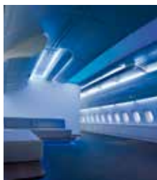
A 380