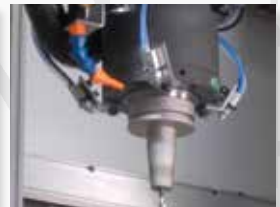
Minimum quantity lubrication, cooling nozzle at working unit