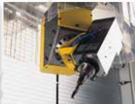
Milling spindle HSK F63, 16 or 26 kW