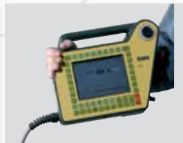
BWO RC 910