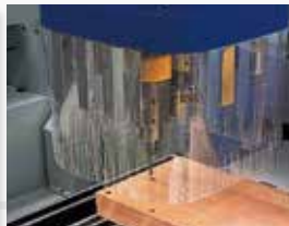
NC-adjustable chip collecting system