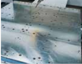
Aluminium flat surface table