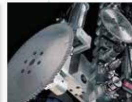
Saw blade pick-up place