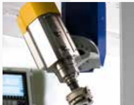
MAKA milling spindles HSK F63, 16 or 26 kW