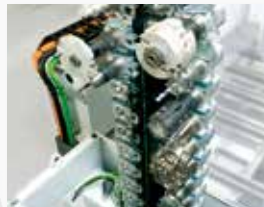
Chain-type magazine with 16 or 32 tool places