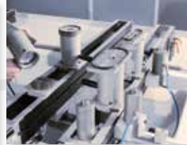
Cross bar table with vacuum pod package