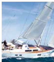
Hanse 630