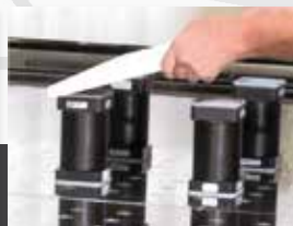
SCHMALZ-Innospann vacuum clamping system