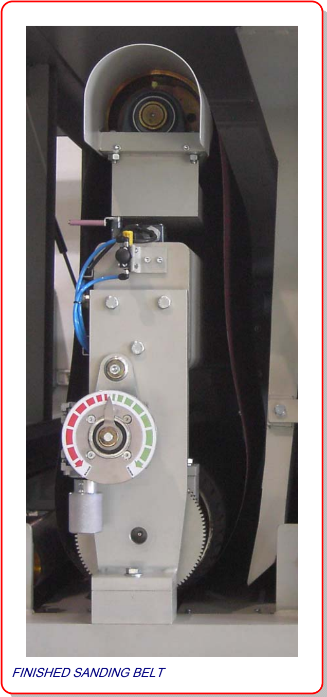
FINISHED SANDING BELT