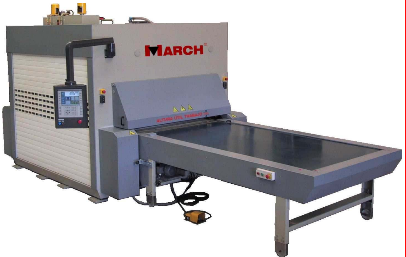
MODEL PM2 1423

Press for the coating of fibreboard to one or two sides with carved wood veneers.