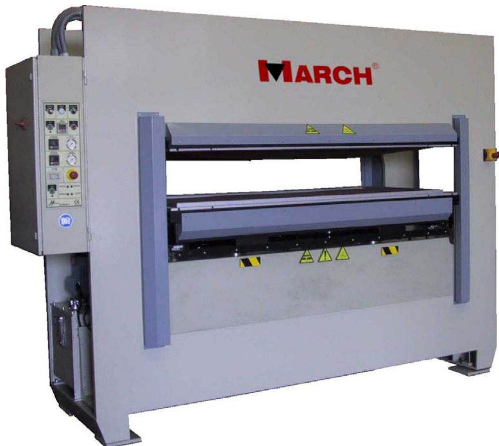
MODEL PV2 2010

For panels covering one or two sides with carved wood veneers. Especially for small productions.