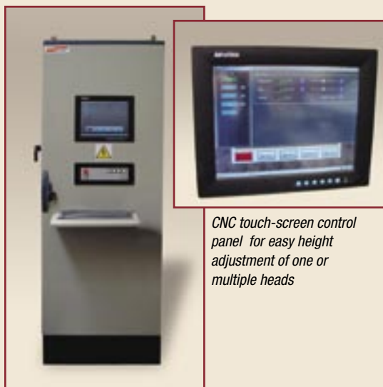
CNC touch-screen control panel for easy height adjustment of one or multiple heads