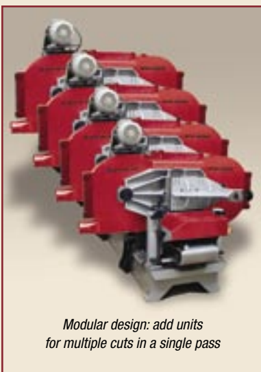
Modular design: add units for multiple cuts in a single pass