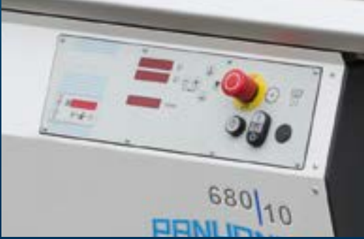
680 10 Rip fence manually adjustable

680 10 Operating panel at the machine body