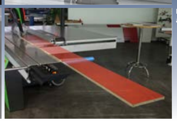
Innovative additional support systems