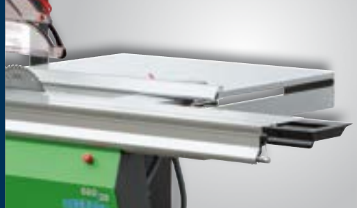
680 20 Motorized rip fence

The 680|10 and 680|20 models embody a new panel saw generation, harmonising function, colour and shape.