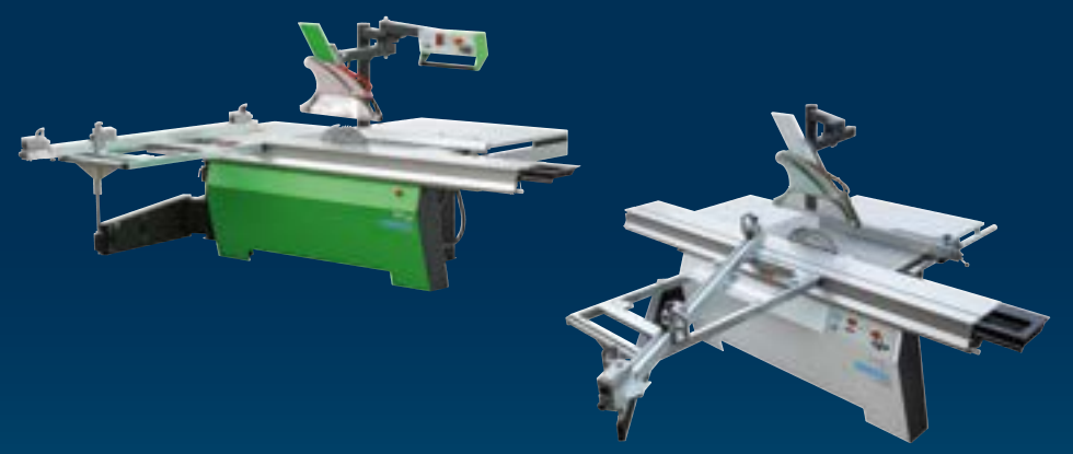
Supporting pad for extra long workpieces