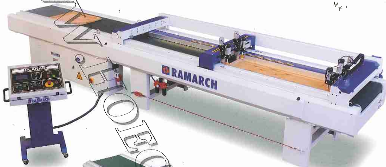
PLANAR EXACTA Ver. Super