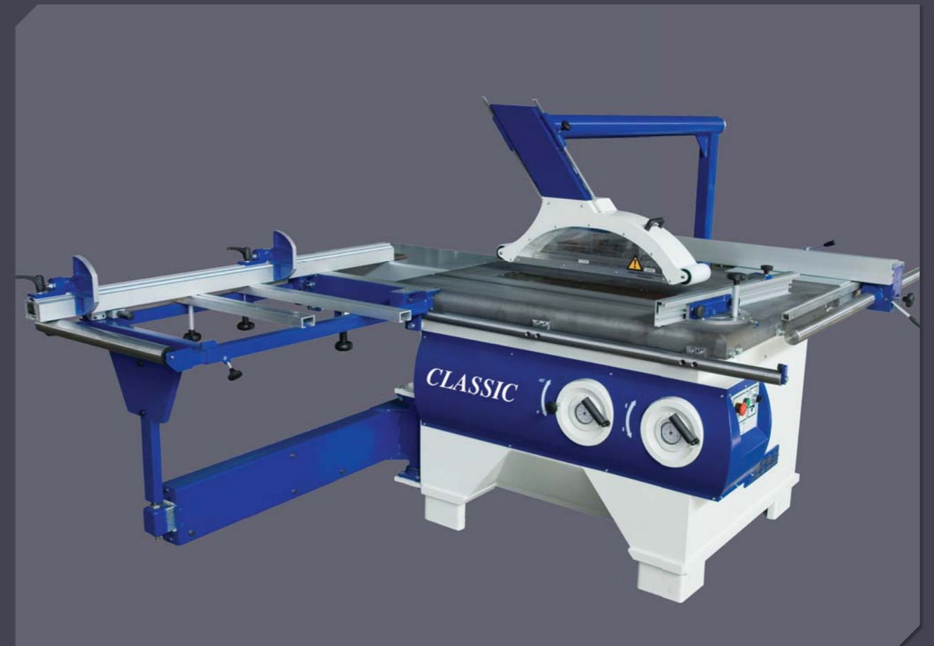
Table circular saws