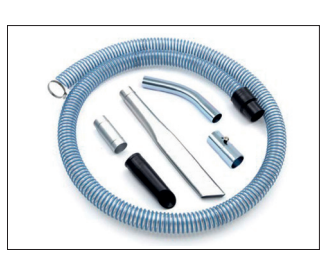
Optional accessory kit for fluid and swarf cleaner.