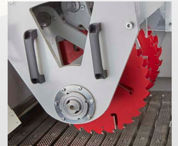
Countersupported sawblade-holder shaft