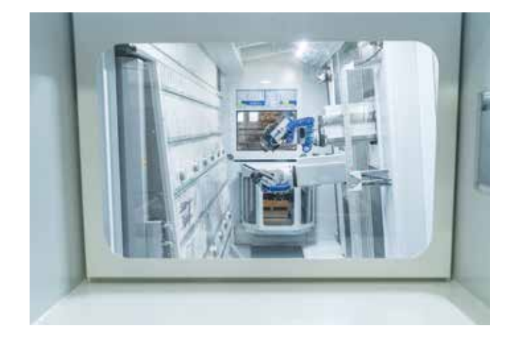
OPERATOR'S WORKSTATION Complete inner view by the operator