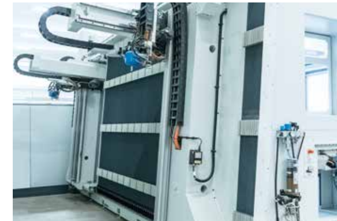
FULL ENCLOSURE Full Enclosure with rear bellows