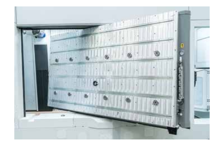
WORKING TABLE Customized working table in accordance with customers' specific needs (Zero-Point, Vacuum, T-Slots..etc.)