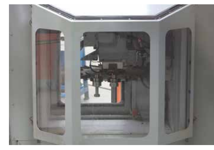
TOOL CHANGER MAGAZINE Safe access and protection from dust