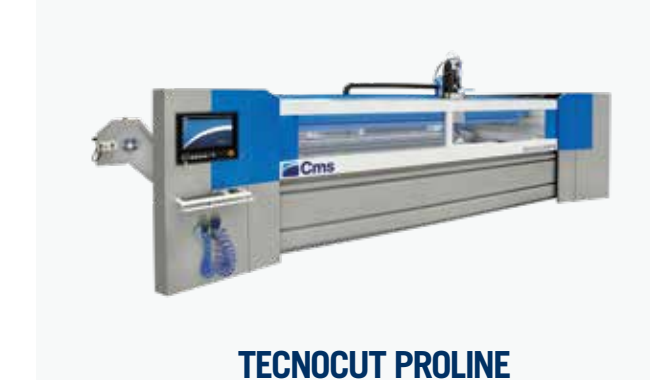
WATERJET CUTTING SYSTEMS