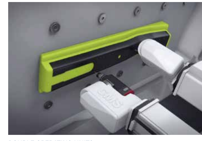
DOUBLE OPERATING UNITS Simultaneous machining with two operating units