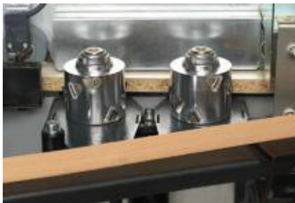
Two counter rotating, controlled spiral jointing cutters