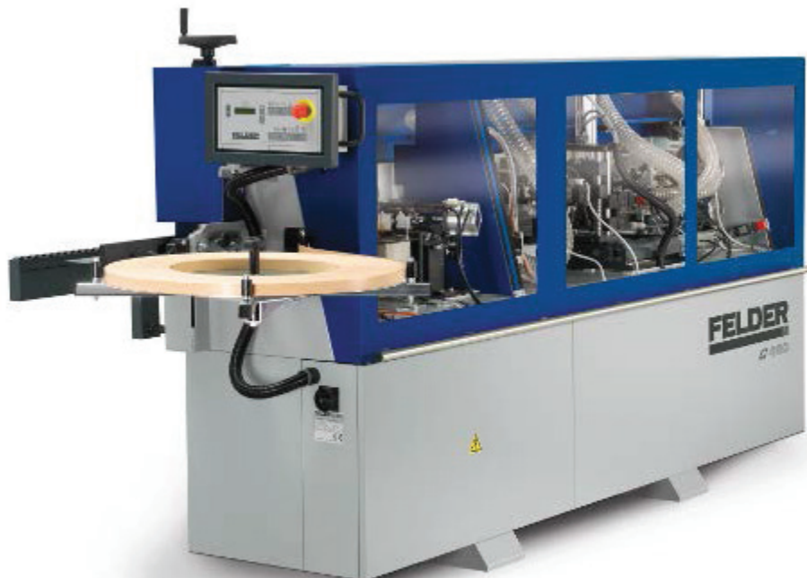
The NEW FELDER G 480

A further highlight is the serially fitted Felder Quick-Set system, which still ensures the most accurate and fastest form of manual edge change without any readjustment. With the two free spaces for additional finishing units, you do not need to make any compromises in flexibility! Optionally fitted with a radius scraper, flush (glue) scraper or polishing unit, an optimal result is guaranteed with every challenge.