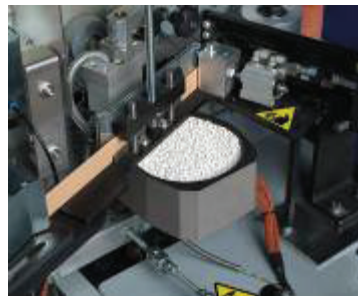
Teflon-laminated glue pot with a capacity of 1.2 kg