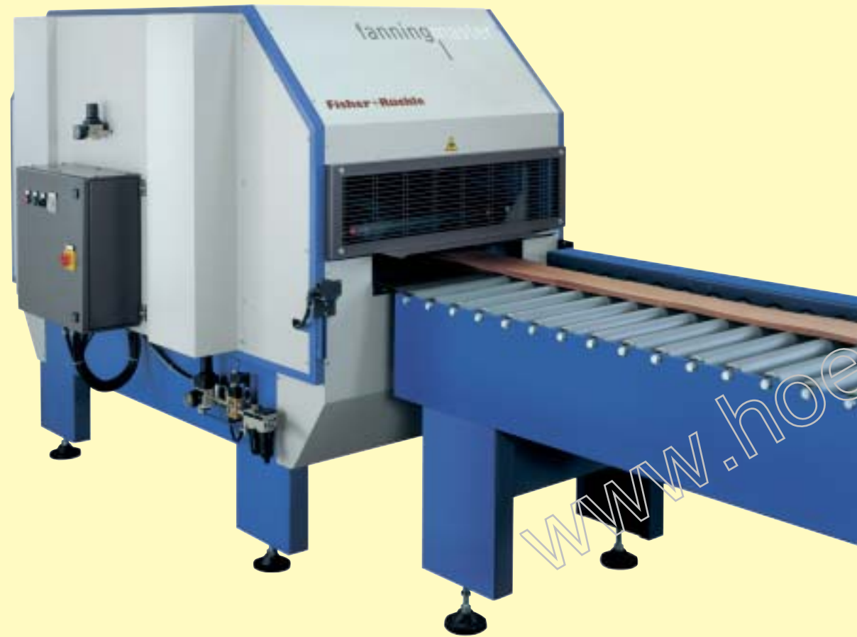
Gluemaster and Fanningmaster at Fuprin, Swedwood Group (IKEA), Germany