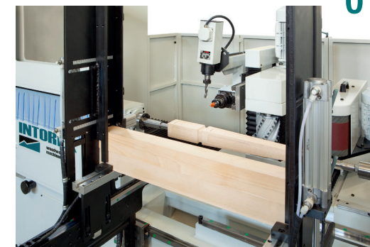
Standard machine: frontal hopper feed loader, horizontal router head, vertical (tilt) router head, shaping and sanding unit.