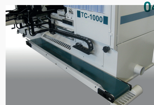
Optional equipment: Transfer exit belt to eject the finished parts.