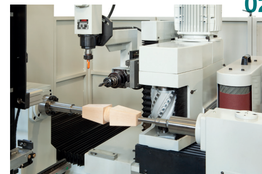
Detail of machining two sofa legs at the same time with straight vertical router head.