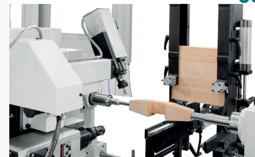
Detail of machining two sofa legs at the same time with tilted vertical router head.