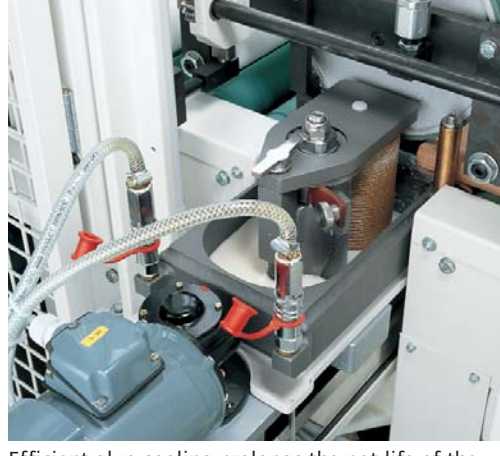
Efficient glue-cooling prolongs the pot-life of the glue considerably.