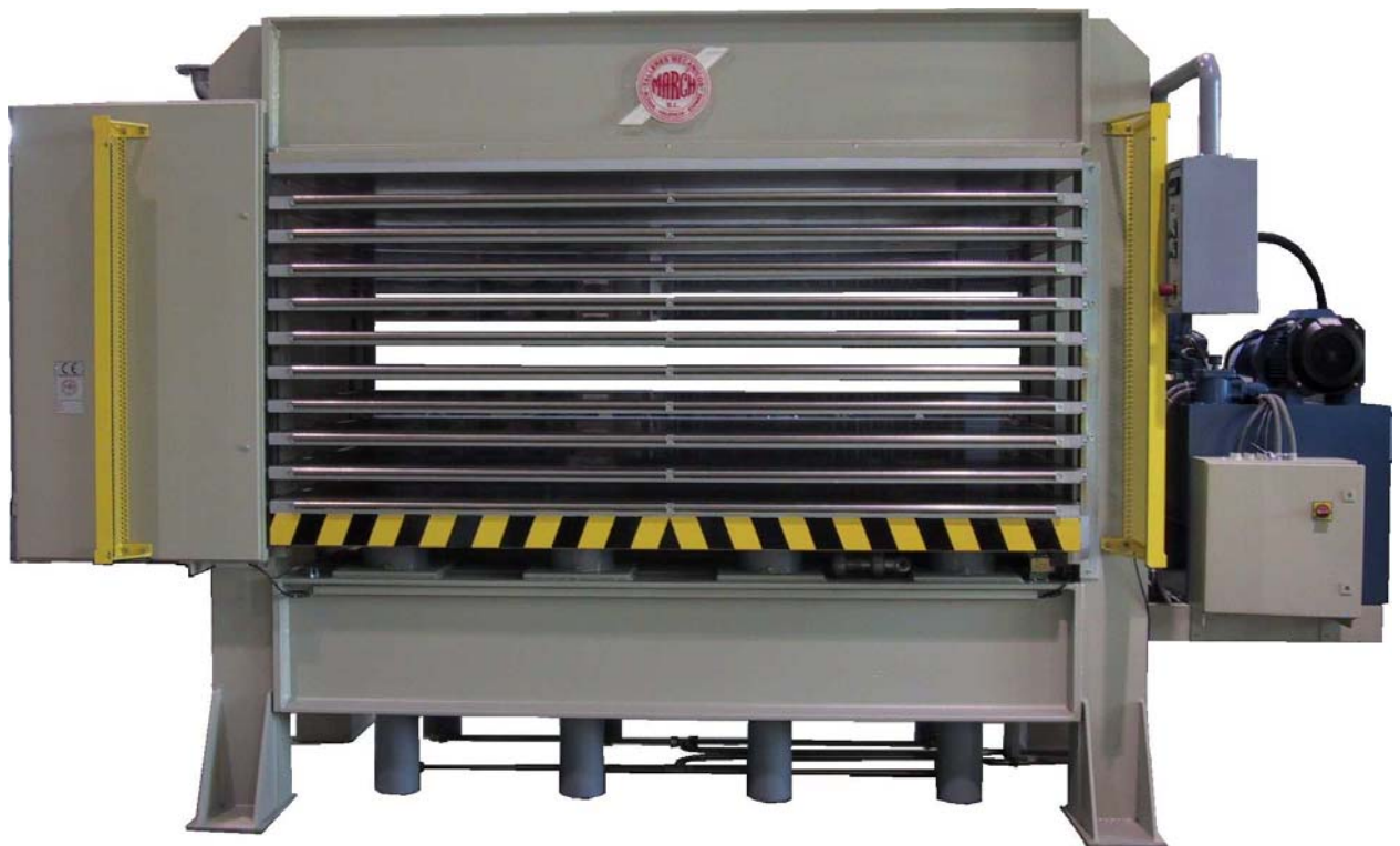
MODEL PHH 2714-10

The number of jobs opening will be adjusted according to the needs of our customers.