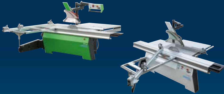
Double sliding table Smoothly running and maintenance-free