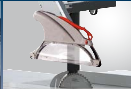
Protective hood with change insert for all saw blade positions