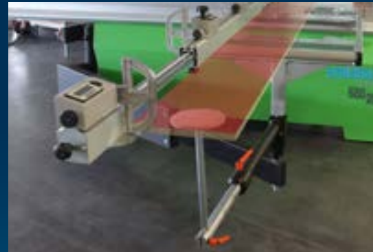
Supporting pad for extra long workpieces