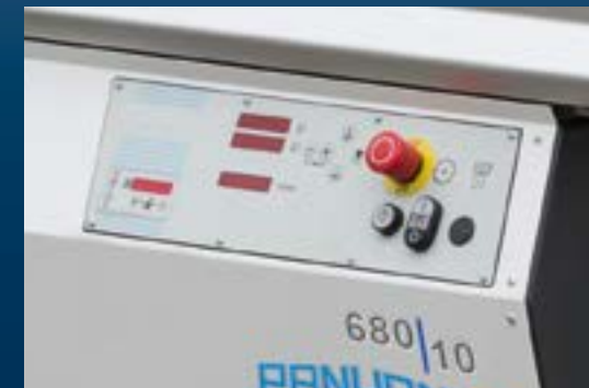
680|10 Rip fence manually adjustable