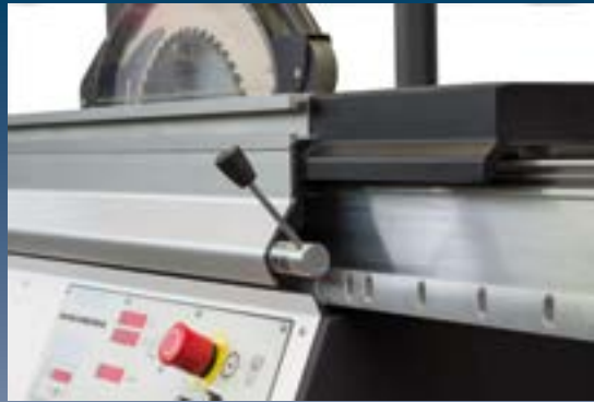
Saw blade swivelling 0 - 47°