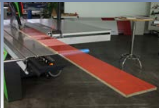
Innovative additional support systems