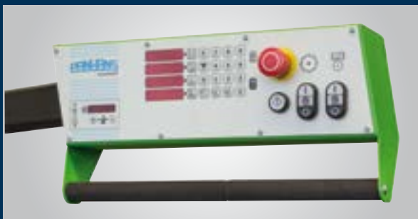
680|20 Operating panel at eye level