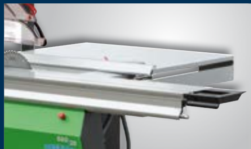
680|20 Motorized rip fence

The 680|10 and 680|20 models embody a new panel saw generation, harmonising function, colour and shape.