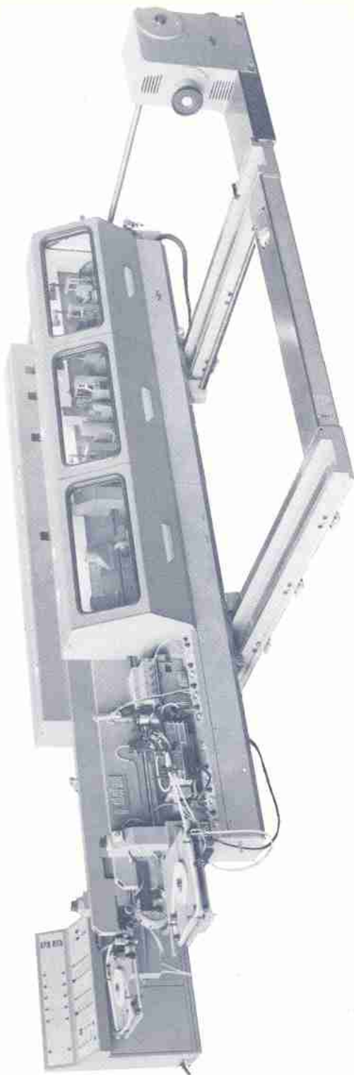
Art. 2114 Double edge bander STEFANI Mod. "IBIMATIC 430-580"