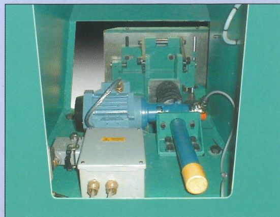
Power Operated Fence