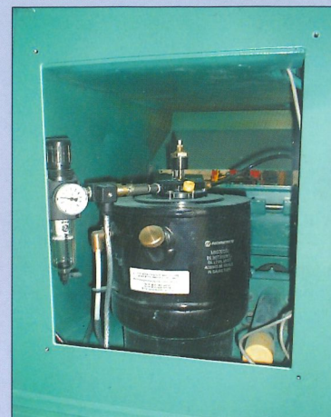
Pressurised Spray Lubrication (Optional)