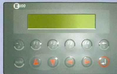
HMI Control Unit