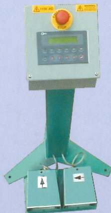
Remote Control Pedestal (Optional)