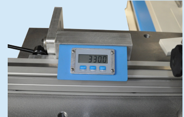
Digital read-out and one large swiveling back stop