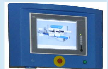
15" touch panel with separate control console