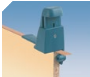
Clean and exact cut.

For cutting the excess of tape at both ends of panel. It provides a clean and exact cut, avoiding to damage the panel already banded. For cutting tapes on PVC, melamine, polyester, veneer, etc... up to 45 mm width and 2 mm thick. The blades can be sharpened. Possibility to regulate the cutting position.