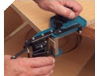
Cutting on both sides on straight panels.

For cutting the excess of PVC, melamine, polyester, veneer, etc. tapes up to 45 mm width and 3 mm thick at both ends of panel. It provides a clean and exact cut, avoiding to damage the panel already banded. The guillotine system allows to cut the tape without effort. The blades can be sharpened. Possibility to regulate the cutting position. It enables precise angular cutting up to 60°.