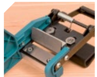
Cutting system with two blades.