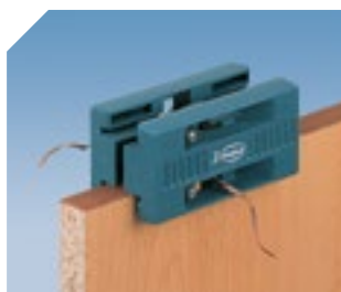
Trims both sides simultaneously.

Cuts both sides simultaneously. For edges up to 40 mm. For larger edges it can be used as two independent edge trimmers. Top quality long life blades which are easy to replace once worn.