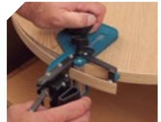
Cutting on circular panels.