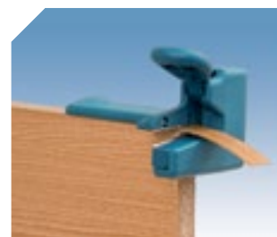
Clean precise cut.

It allows a perfect, clean and high quality cut on all the corners of the board. No other finishing operations are needed. Equipped with twin use blades. For trimming PVC, melamine, Polyester, veneer, etc. up to 0.6 mm thickness