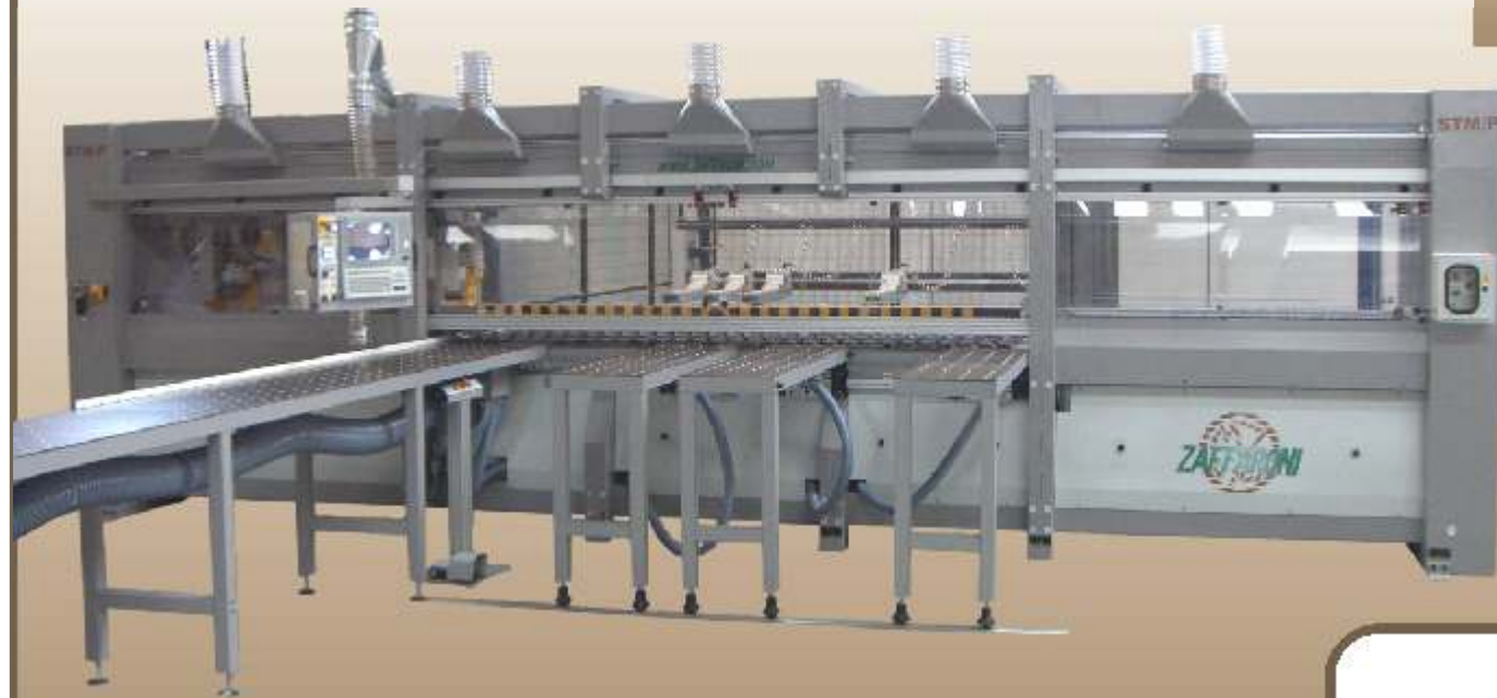
Front view of the STM/P/4T