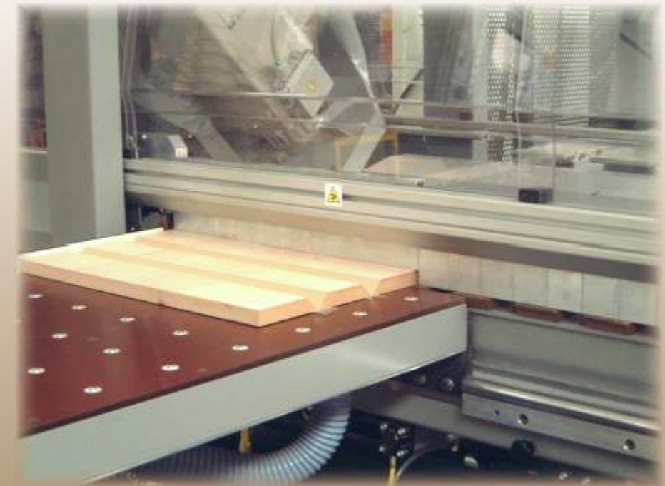
View of the hands protection Safety system

The Working centre for the Folding system has been studied for executing both longitudinal and transversal precision V-cuts on panels, coated with PVC or also with not bending materials that needs the adhesive tape application.