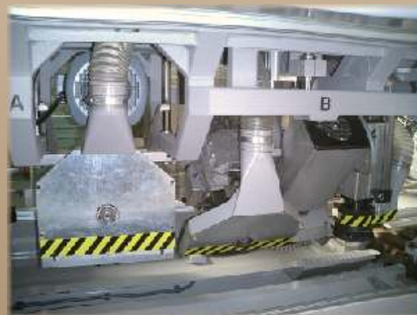
Head-holder carriage type 3T