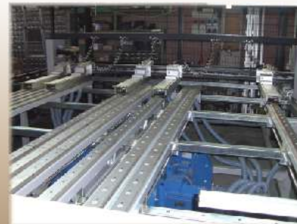
Pincers-holder carriage with air pads system