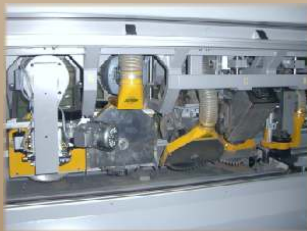
Head-holder carriage type 4T