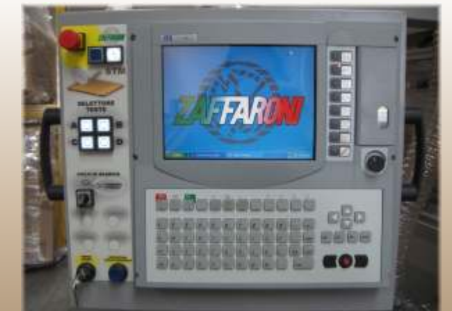
CNC Controls panel