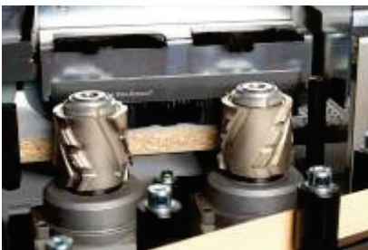
Unique in the compact class: Twin-engine premilling unit