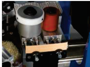
Proven for years: Felder Quick-Set-System