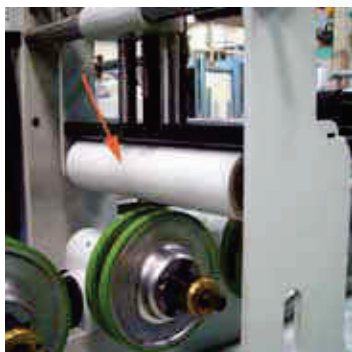
Adjustable first moulding roller. (PUR)