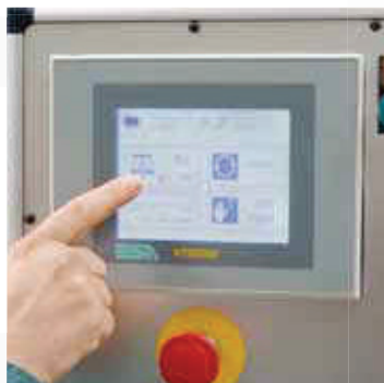
Glue grammage regulation system through PLC. (PUR)