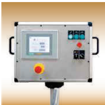
Raised control panel with gramage control and PLC. (PUR)