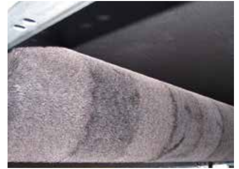
Belt cleaning equipment (option)