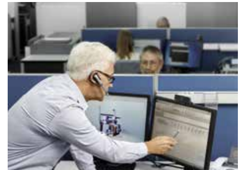
Remote Service: Excellent machine availability thanks to shorter periods of idle time and therefore lower production costs.