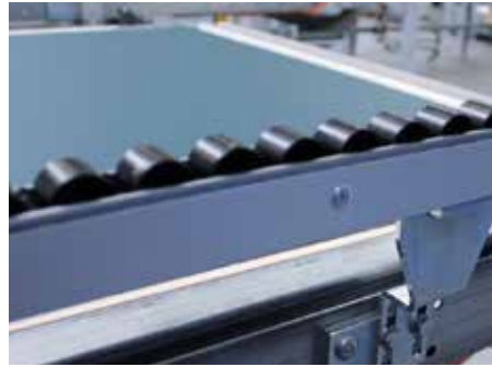
Small roller gib to to support wide workpieces (option)