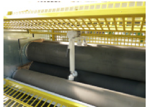
Automatic cleaning of the rollers