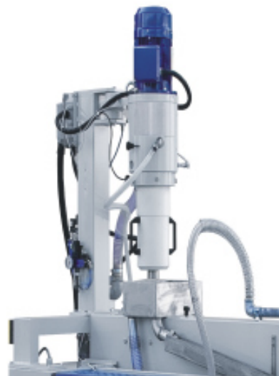
Automatic glue supply