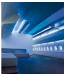
A 380