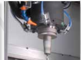
Minimum quantity lubrication, cooling nozzle at working unit