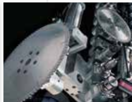
Saw blade pick-up place