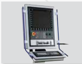
Siemens OP 19 A TCU / Siemens OP 19 A PCU