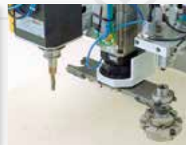
Tool shuttle for quick tool change