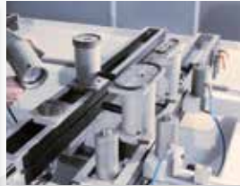
Cross bar table with vacuum pod package