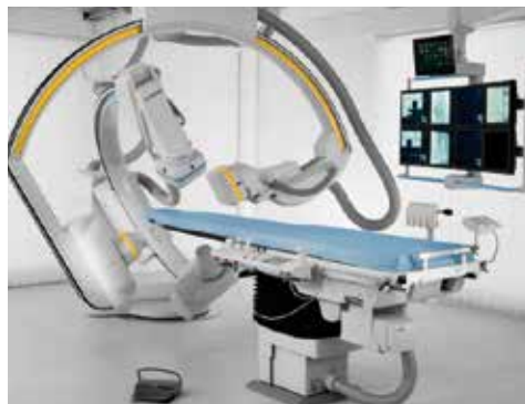
© Artis Zee, biphanes Angiographie System von Siemens Healthcare