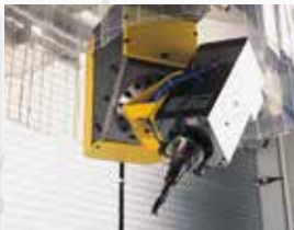
Milling spindle HSK F63, 16 or 26 kW