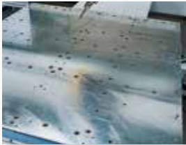
Aluminium flat surface table