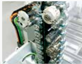
Chain-type tool magazine with 16 or 32 places