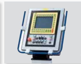
BWO CNC 920 / BWO CNC 930

State-of-the-art control system technology by Siemens or BWO. Machines connection possible via post-processors to CAD.