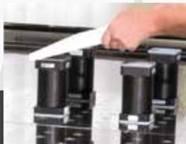
SCHMALZ-Innospann vacuum clamping system