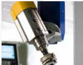
MAKA milling spindles HSK F63, 16 or 26 kW