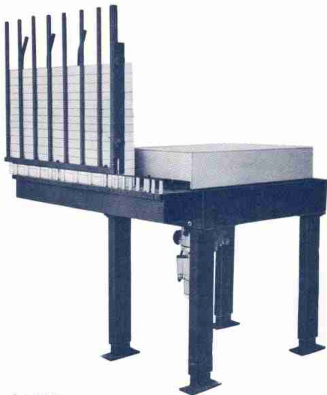
Art. 2061 Automatic feed applicable on all types of planting and molding machine.