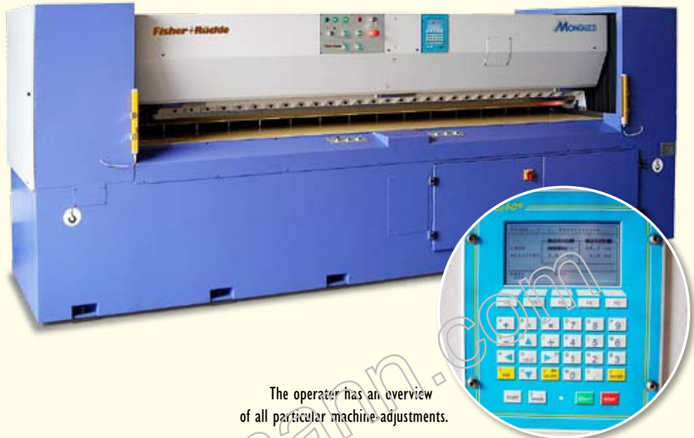
The operator has an overview of all particular machine adjustments.