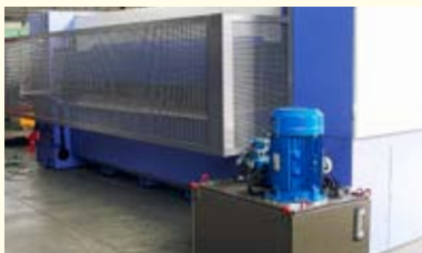
Powerful hydraulic for the movement of the pressure beam and both knives.