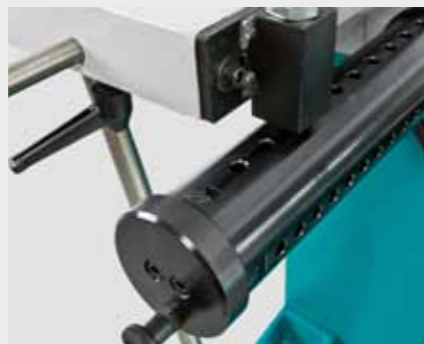
Central fence with angle parking position (Option TM100531)