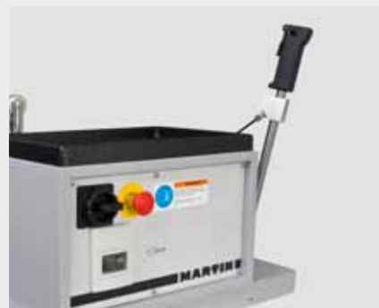
Pin drilling device with remote control (Option TM100521)