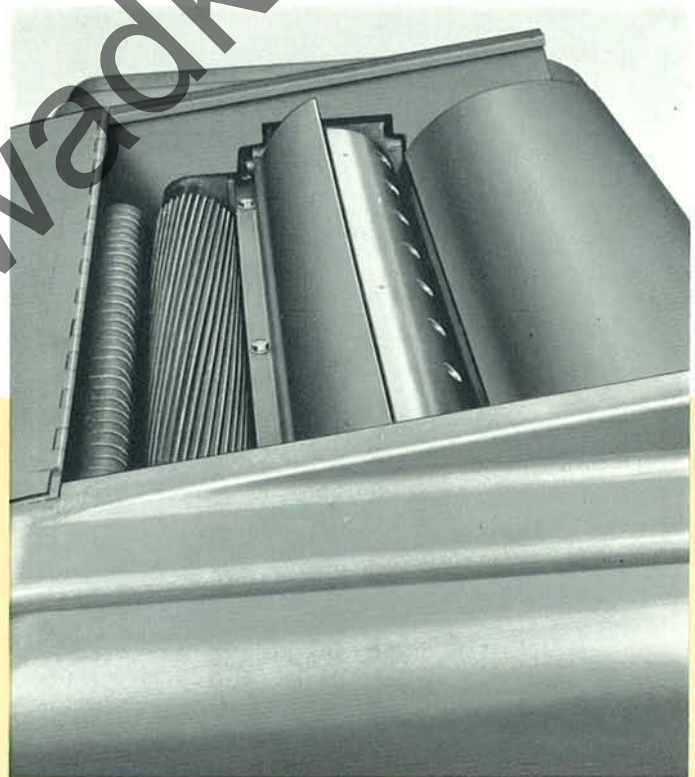
Cover hinges back giving convenient access to cutterblock and feed rolls.