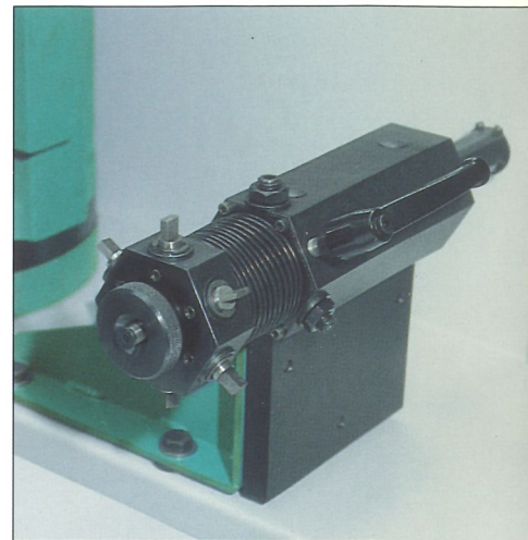
Quick adjusting multi-stylus arrangement.