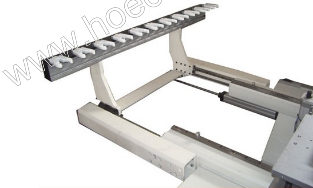
MAGAZZINO UTENSILE 11 STAZIONI 11 STATION TOOLSTOCK MAGASIN D'OUTILS À 11 STATIONS ALMACÉN UTENSILIOS 11 ESTACIONES