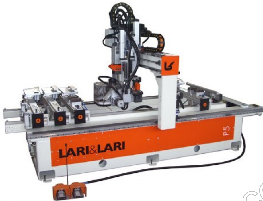
CENTRO DI LAVORO P5 P5 MACHINING CENTRE CENTRE D'USINAGE P5 CENTRO DE TRABAJO P5