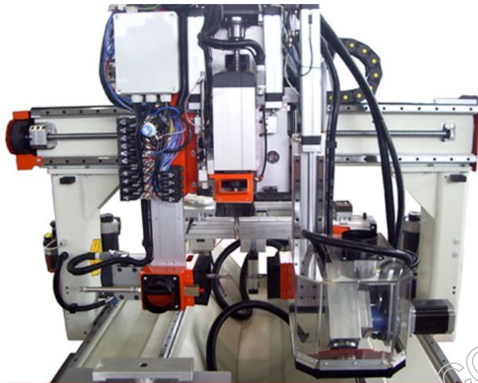
CENTRO DI LAVORO P5 P5 MACHINING CENTRE CENTRE D'USINAGE P5 CENTRO DE TRABAJO P5