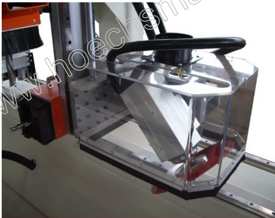
GRUPPO TAGLIO LAMA 0°-180° 0°-180° BLADE CUTTING UNIT GROUPE DE COUPE LAMA 0°180° GRUPO CORTE HOJA 0°-180°