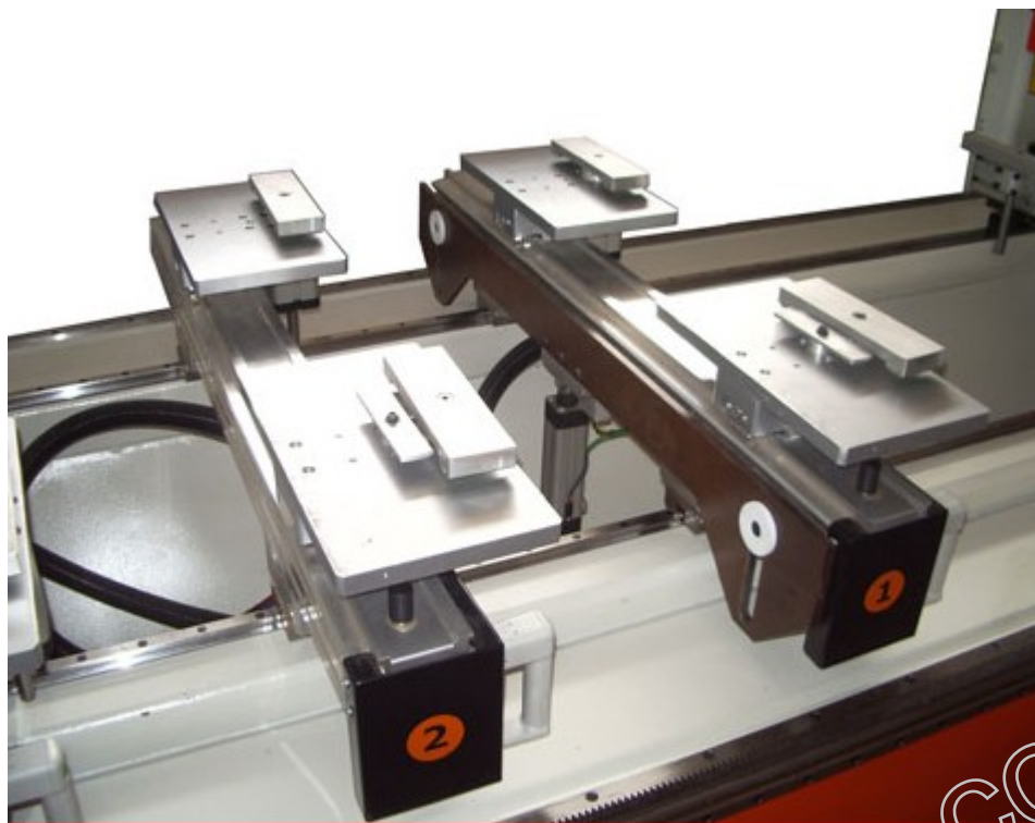
PRESSORI PER LAVORAZIONE TELAIO PRESSOR FOR PROCESSING FRAME PRESSOR DE TRAITEMENT DE TRAME PRESSOR PARA LA ELABORACIÓN DEL MARCO