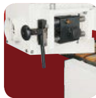
Belt Tensioning Device practical to use

Belt sanding machines for edges and surfaces, extremely simple and reliable over time, for demanding DIY woodworkers and woodworking shops.