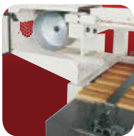
Pulleys speed under control